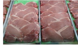
Center Cut Pork Chops