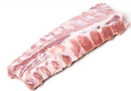
Baby Back Ribs