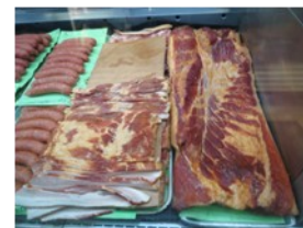
Rind on Bacon