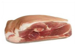
Bone in Pork Butt